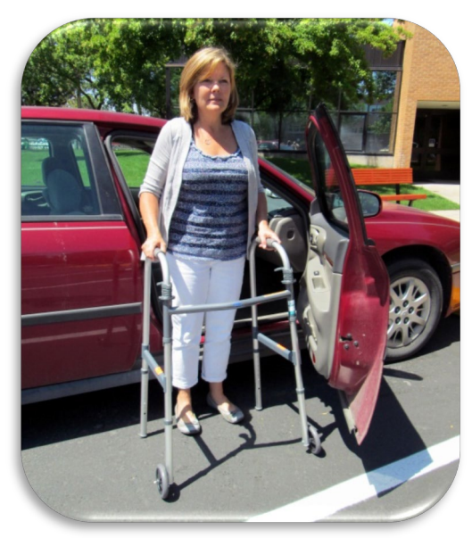
Back up to the car until you feel the car with the back of your legs.