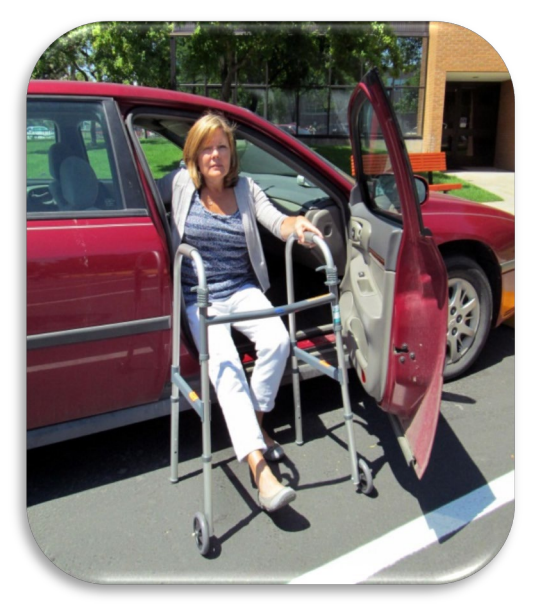
Lower yourself to the seat, holding on to a stable surface. Slide your bottom back on the seat as far as you can.