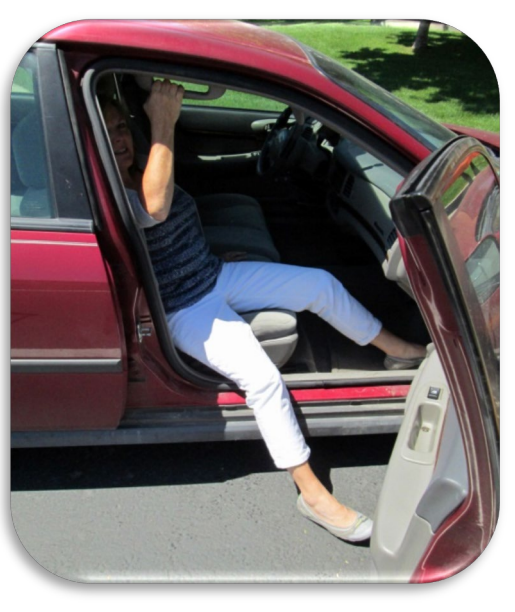
Bring your legs into the car one at a time.

If your destination is more than one hour away, plan on stopping approximately every hour and getting out of the car to take a 5-10 minute walk.